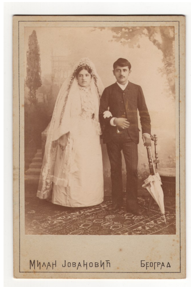
Wedding photograph