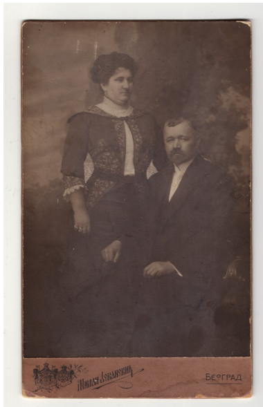
Studio portrait of a couple